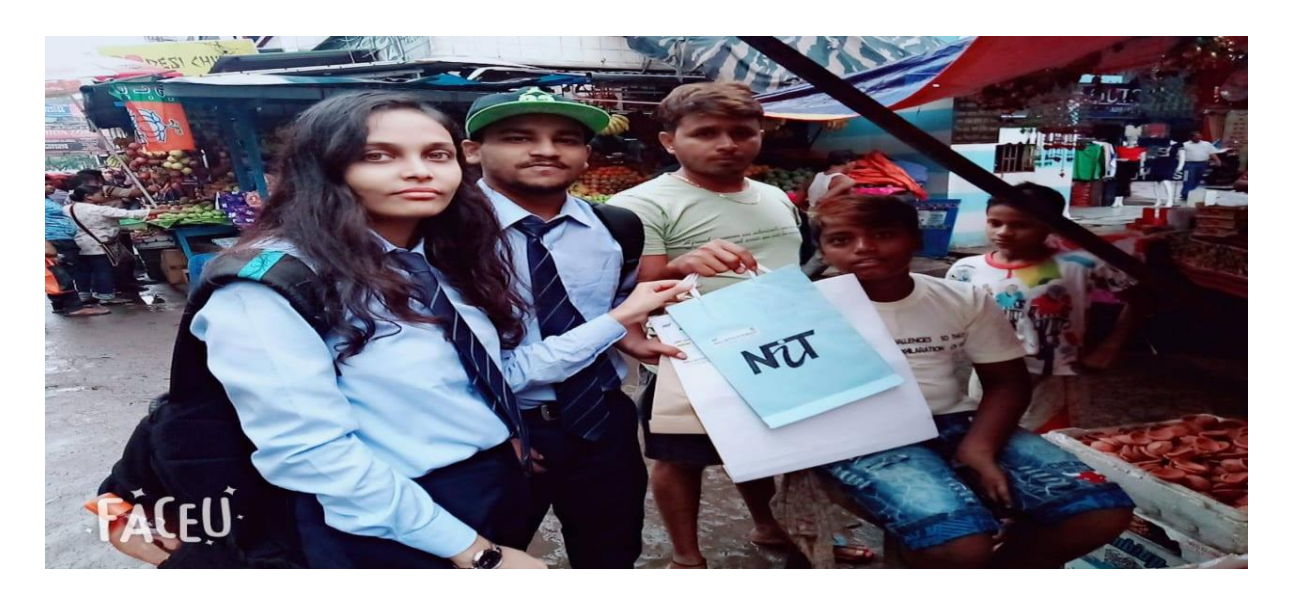
Distribution of Paper Bag conducted on 25.10.19

The students pledged to bring about changes in the society regarding plastic usage and prepared bags made of paper and newspaper by themselves. The bags were then taken to the marketplaceand distributed free of cost by the students.