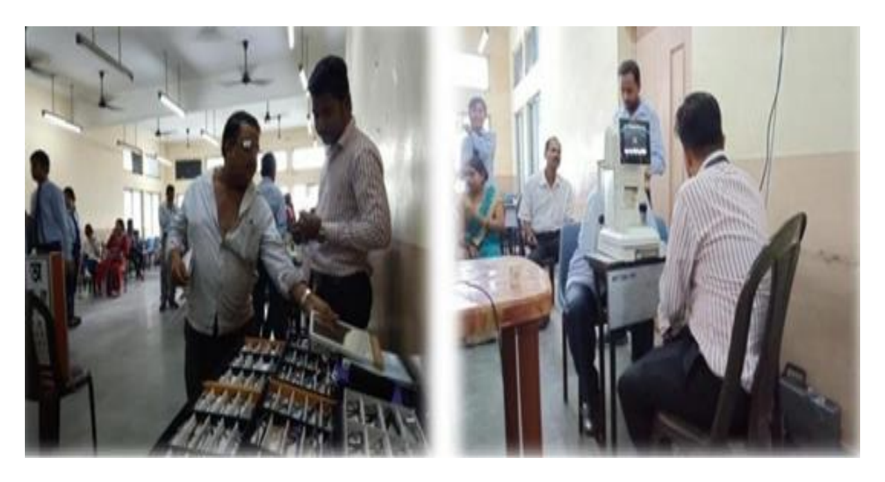
Eye Check Up Camp conducted on 26-09-19