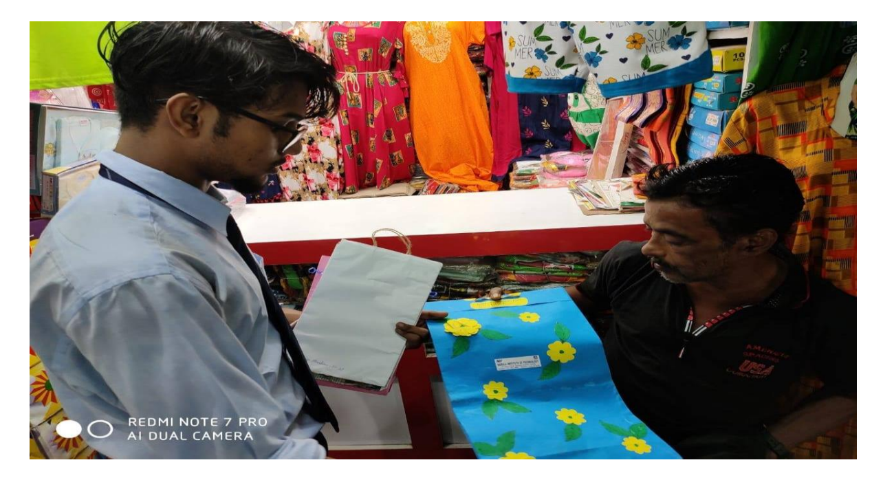
Distribution of Paper Bag conducted on 25.10.19