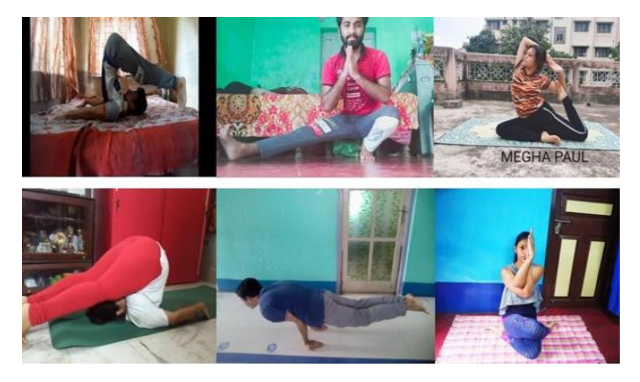
Students performing Yoga during online session conducted on 21.06.20